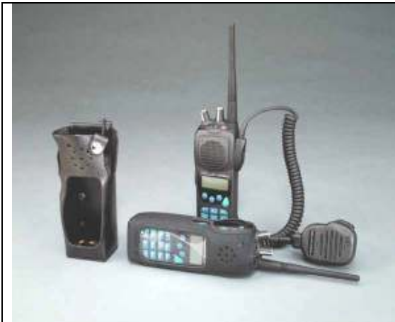
Guardian Portable Radio with Carrying Case and Speaker Microphone