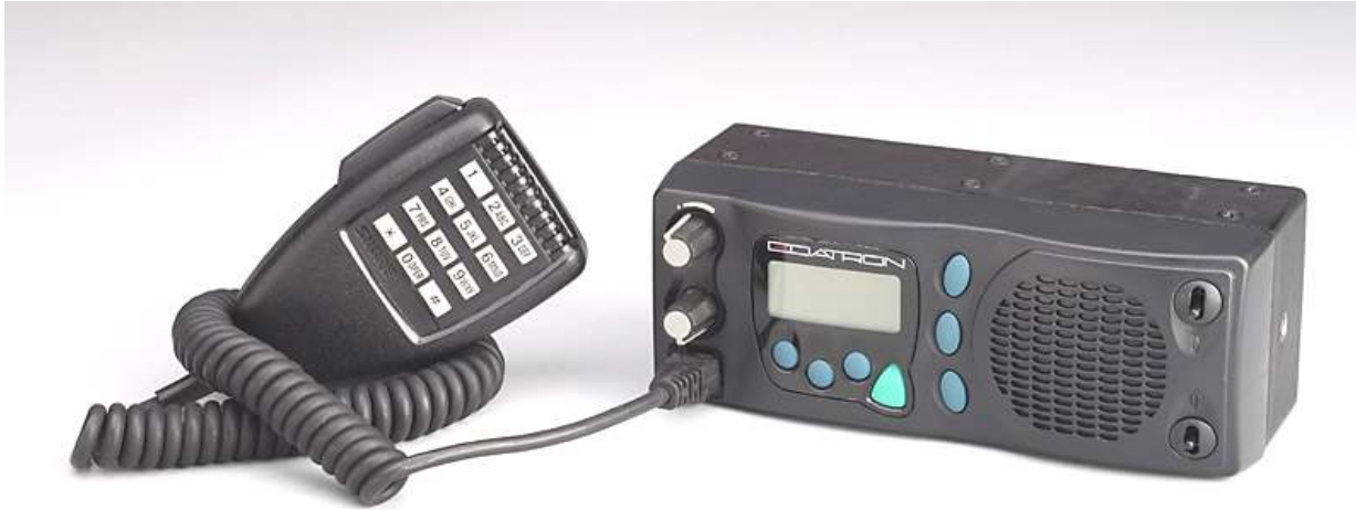
Guardian 5W Mobile Radio