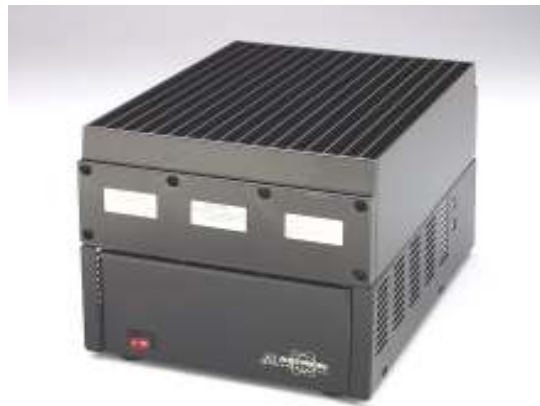
G25RBV110 Power Amplifier and Supply