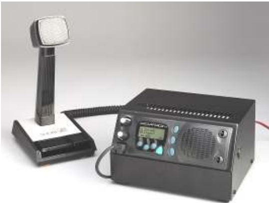
G25RBV110 Control Console

The radio is fully programmable using a PC computer and Guardian software and may be cloned (parameter subset) with another Guardian radio. Selective programming may be performed using the optional DTMF microphone.