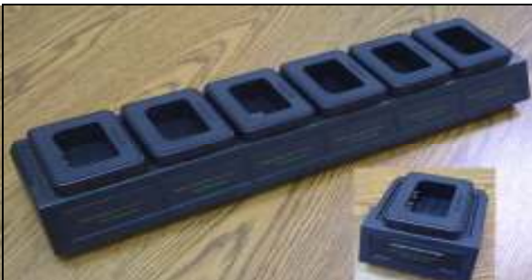
Guardian Portable Radio with Batteries and Battery Chargers